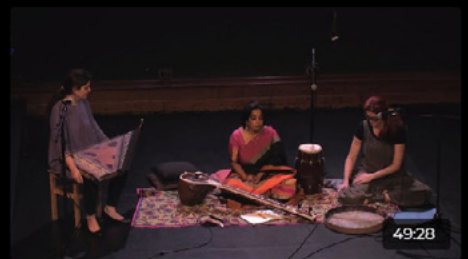
The Resonant Heart