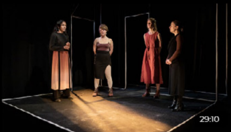
Khyaal Vocal Ensemble