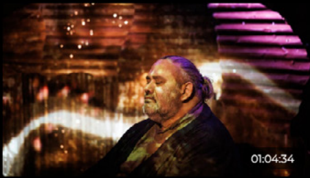
An Indigenous Trilogy - Act I: Three Magpies Perched in a Tree