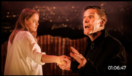
An Indigenous Trilogy - Act II: Masterpiece