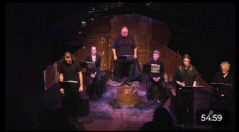
An Indigenous Trilogy - Act III: Some Secrets Should Be Kept Secret