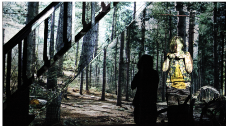
How Humans Can Fly

Send us an email with the subject 'Save the World' to info@lamama.com.au and you will receive an online version as well as doing a good deed!