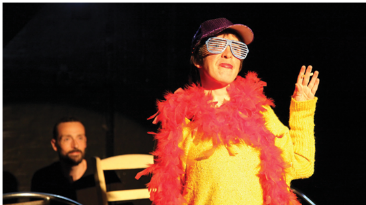
Am I A Wandering Star

La Mama's list of Alumni reads like the Who's Who of Australian theatre including such greats as David Williamson, Cate Blanchett, Jack Hibberd, Graeme Blundell, Judith Lucy and Julia Zemiro. La Mama is proud to play a crucial role in fostering the distinguished careers of so many established and emerging Australian artists.